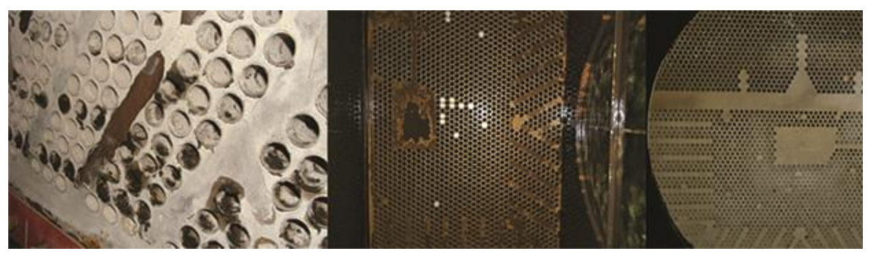
2. The image of the condenser tubes on the left was taken before installation of the Flow-Tech treatment system. The center and right-side images show a dramatic decrease in fouling after the Flow-Tech system was operated.

the duration of the trial. After three months of Flow-Tech operating in the system, the plant eliminated its use of the silica inhibitor. The end-of-year shutdown revealed the condenser tubes and auxiliary equipment to be clean of any new scale (Figure 2).