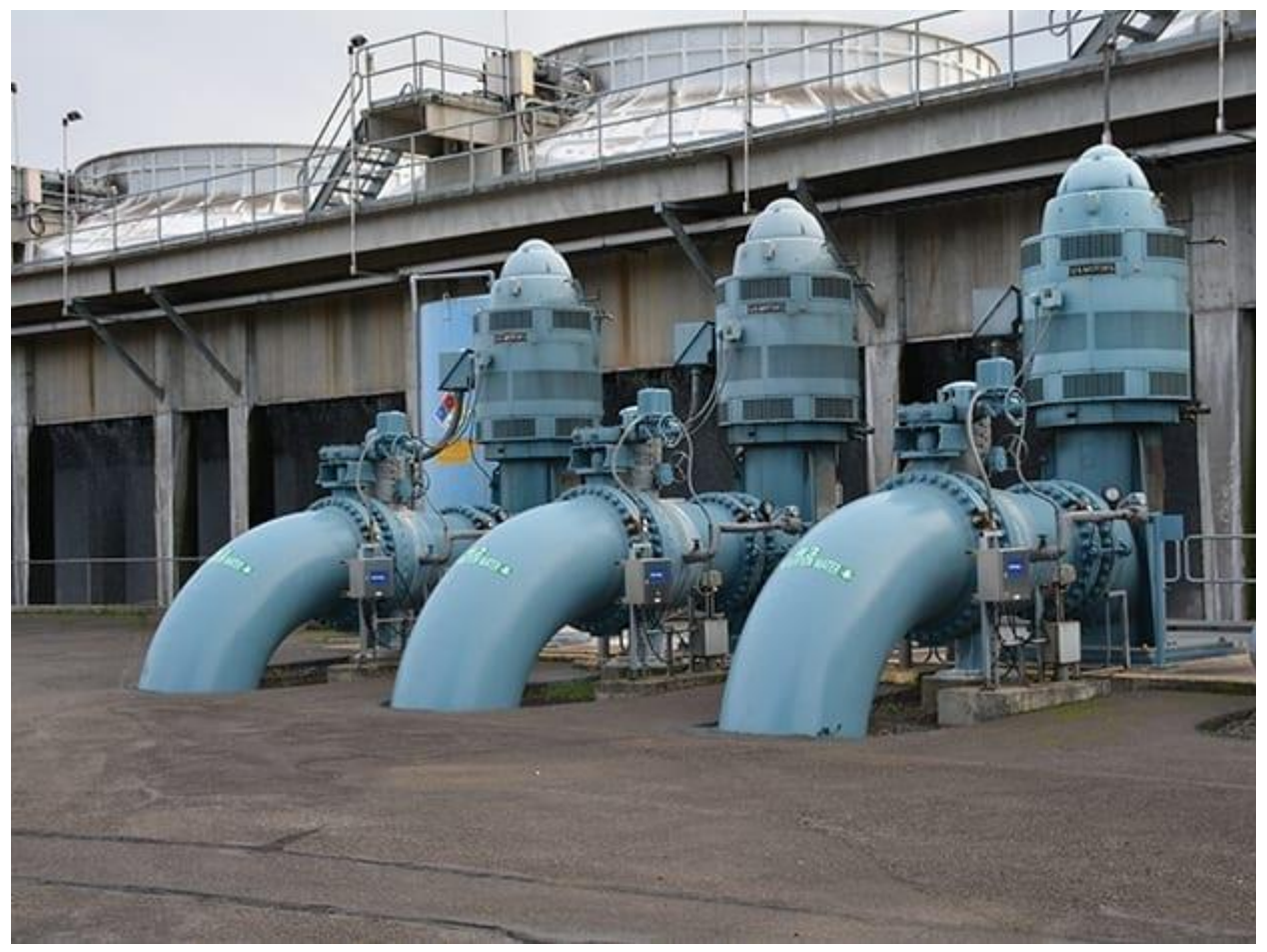
1. Flow-Tech electronic treatment technology is installed through a non-invasive process. System components are shown here mounted on flanges on the discharge of circulating water pumps.

pumps (Figure 1). Commissioning of the system did not interrupt daily operation and was accomplished in a matter of hours.